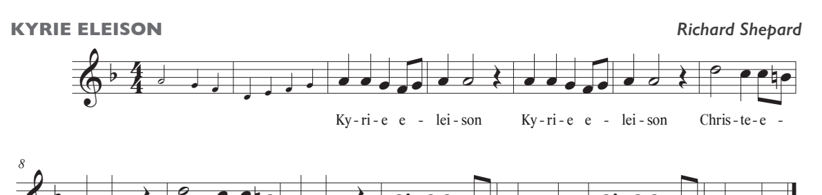
Lord, have mercy. Christ, have mercy. Lord, have mercy.

Christ himself bore our sins in his body on the cross, so that, free from sins, we might live for righteousness. (1 Peter 2:24)